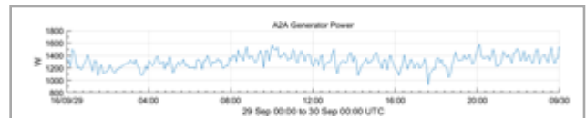
Example of the PB3 PowerBuoy daily power generation, as measured by its internal instrumentation over a 24-hour period in high sea-states (September 29th 2016). This, and other data is live-streamed to OPT headquarters in Pennington, NJ

Photos accompanying this announcement are available at http://www.globenewswire.com/NewsRoom/AttachmentNg/51436646-722d-44f3-9565-5097f792f1d3 http://www.globenewswire.com/NewsRoom/AttachmentNg/4077c742-