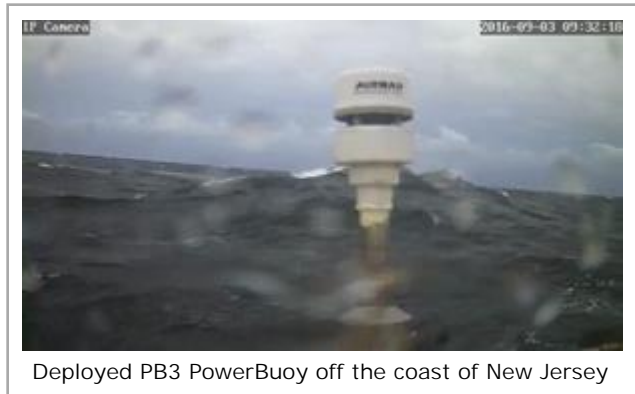
Deployed PB3 PowerBuoy off the coast of New Jersey