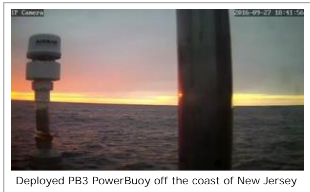
Deployed PB3 PowerBuoy off the coast of New Jersey