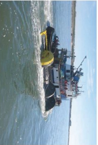
TOWAGE TO OCEAN SITE