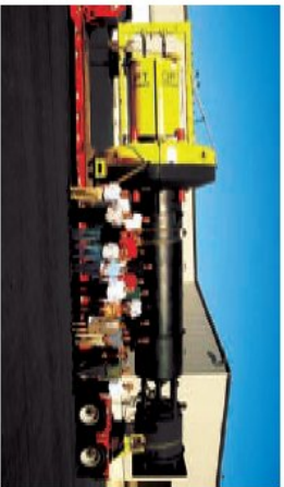
TRANSPORT TO LOCATION