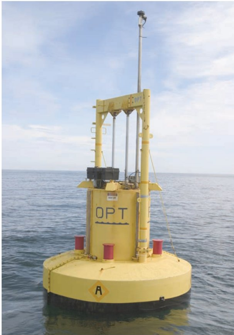
POWERBUOY SYSTEM AS DEPLOYED OFF COAST OF NEW JERSEY, USA